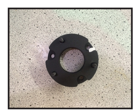
22909-01 / Qty (2) Upper Strut Spacer