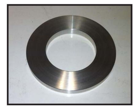
23000-05 / Qty (2) Pre-Load Spacer