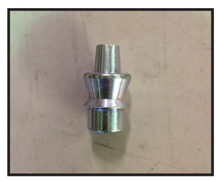
S10259/ Qty (2)