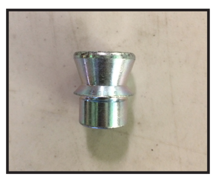
S10246 / Qty (2)