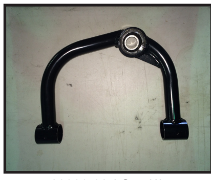
20930-02 / Qty (1) Pass. side Upper Control Arm