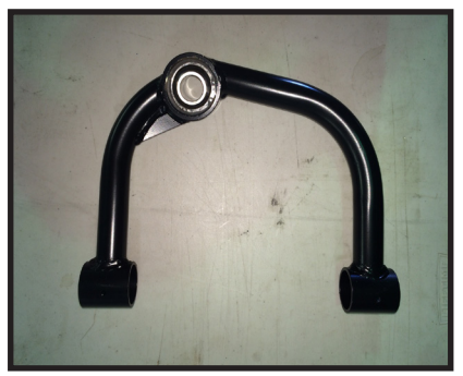
20930-01 / Qty (1) Driver side Upper Control Arm