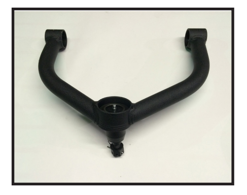
34105-02 / Qty. 1 Passenger side upper control arm