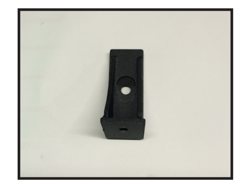
32102-01 / Qty. 2 Bump stop bracket