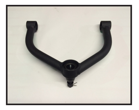
34105-01 / Qty. 1 Driver side upper control arm