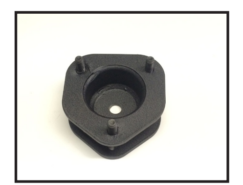
32902-01 / Qty. 2 Upper strut spacer