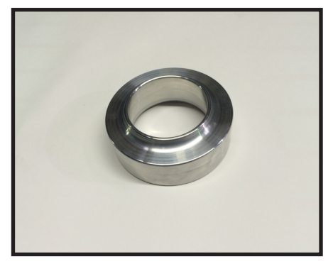
34105-04 / Qty. 2 Strut pre load spacer