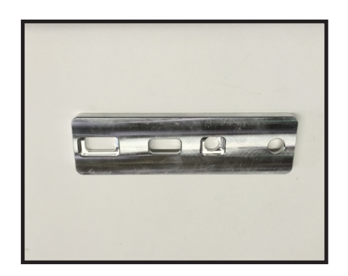
54060-08 / Qty. 2 Sway bar drop brackets