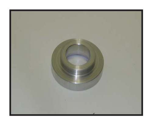
52907-01 / Qty. 2 Upper Strut Spacer