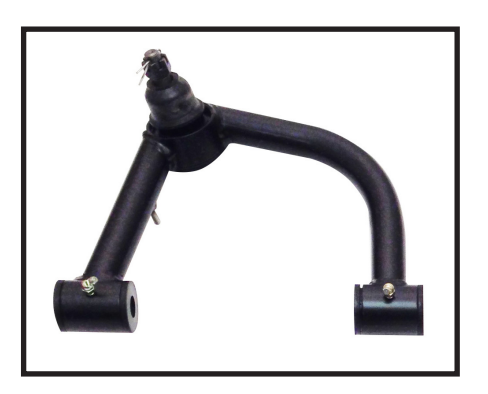
53905-02/ Qty. 1 Passenger side upper control arm