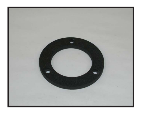
52907-02 / Qty. 2 Strut Pre-load spacer